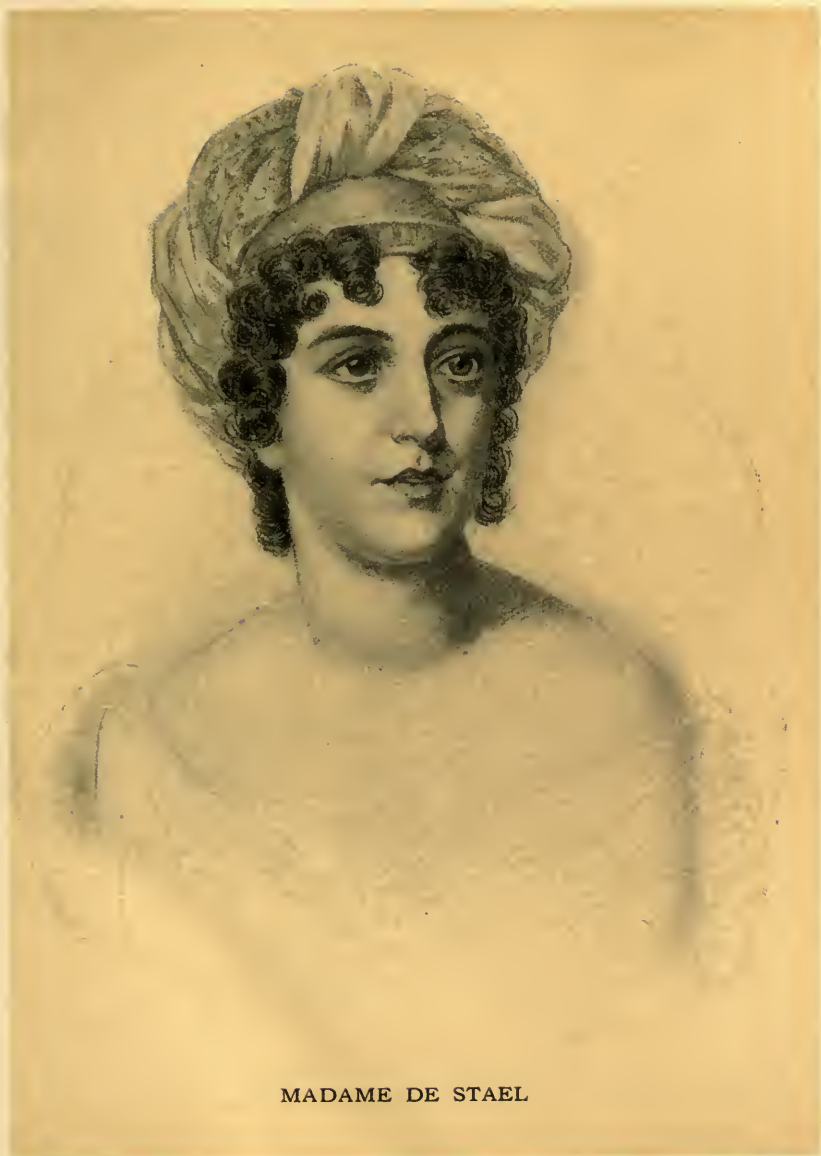
MADAME DE STAEL